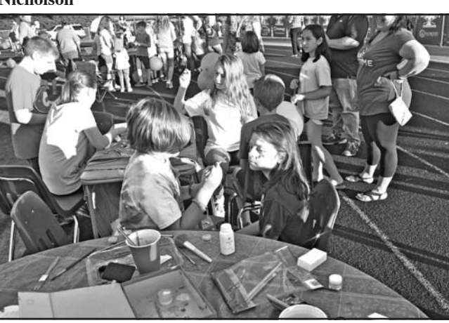
The 2017 Homecoming Carnival on Thursday, Oct. 12. was a huge success thanks to great support from parents, the community, the schools and students.