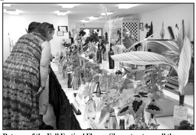
Patrons of the Fall Festival Flower Show stop to smell the roses on Friday, Oct. 13.